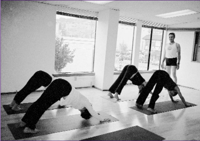
Yoga class at the new YogaKula Studio opening on North Shattuck Ave.